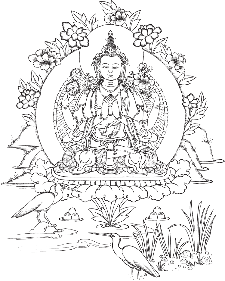
Buddha of Compassion